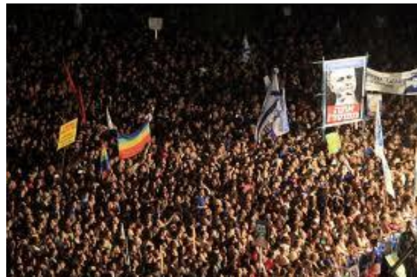
Secular/ Zionist Religious